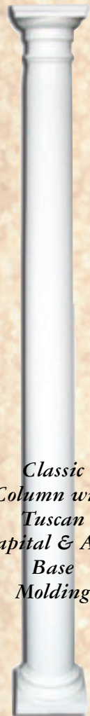
Classic Column with Tuscan Capital & Attic Base Molding