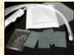
A Split Column Kit should be used to reassemble the split fiberglass or wood column shaft halves.